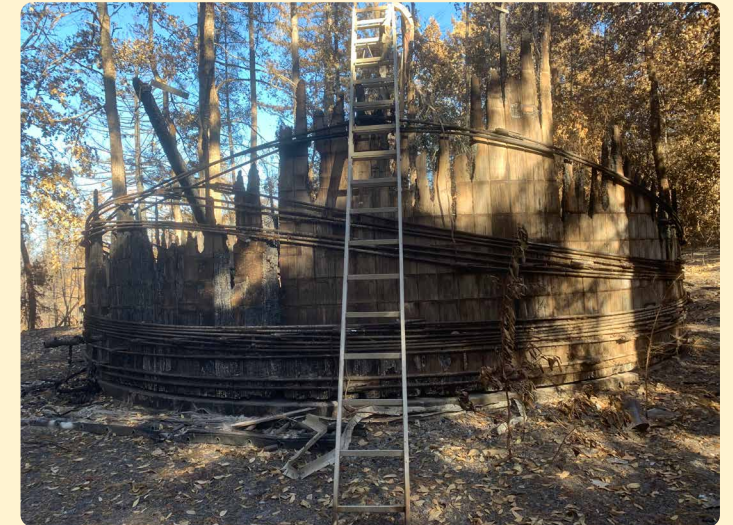
The water tank at Cutter Scout Reservation

were disabled and a lot of hazard trees obstruct the camp. Unfortunately, Camp Oljato will remain closed this summer for repairs; Cutter Scout Reservation will remain closed for the foreseeable future while we develop plans for future use; and Boulder Creek Scout Reservation will operate all of our camping programs.