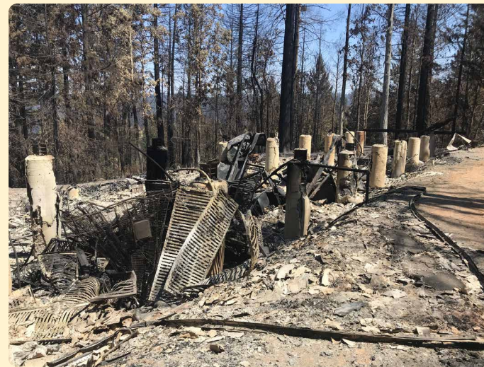
Harkson Lodge Cutter Scout Reservation

As if COVID was not enough of a disrupter, in August, a dry lightning storm (~2,500 lightning strikes) caused over 590 wildfires in the Bay Area. In the Santa Cruz Mountains, home to Cutter and Boulder Creek Scout Reservations, the hot, dry, windy conditions quickly spread and merged the fires covering ~85,000 acres. Boulder Creek Scout Reservation was not in one of the hot spots—the fire encroached but did not engulf the camp. Cutter Scout Reservation was not so lucky, suffering major damage and the complete loss of Harkson Lodge, the ranger's house, and the maintenance building. Just two weeks later, a fire in the High Sierra near Shaver Lake (just below Camp Oljato) grew into the Creek Fire that burned over 375,000 acres. While all of our primary buildings survived and much of the camp was undamaged, our electricity and water systems